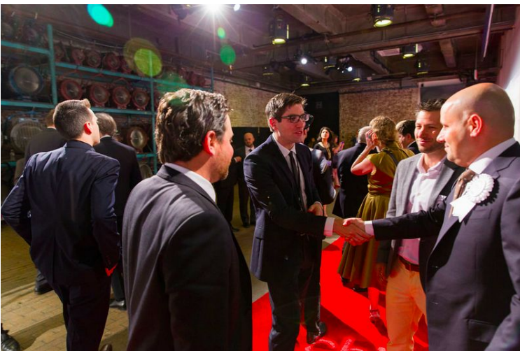
2015 Architizer A+Awards Gala red carpet