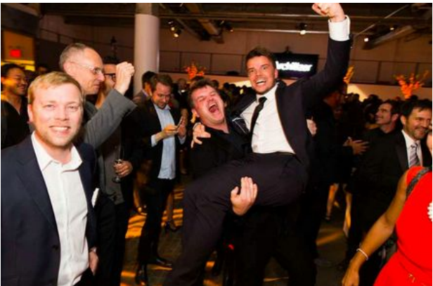
A+Awards winner Bjarke Ingels